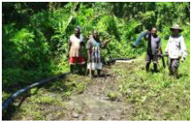
People working in the community Patani South Kelantan Community Association