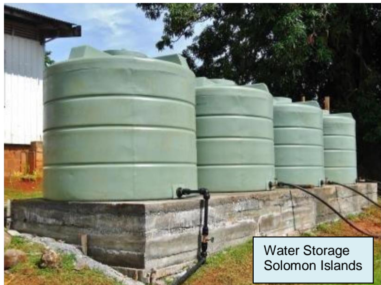
Water Storage Solomon Islands