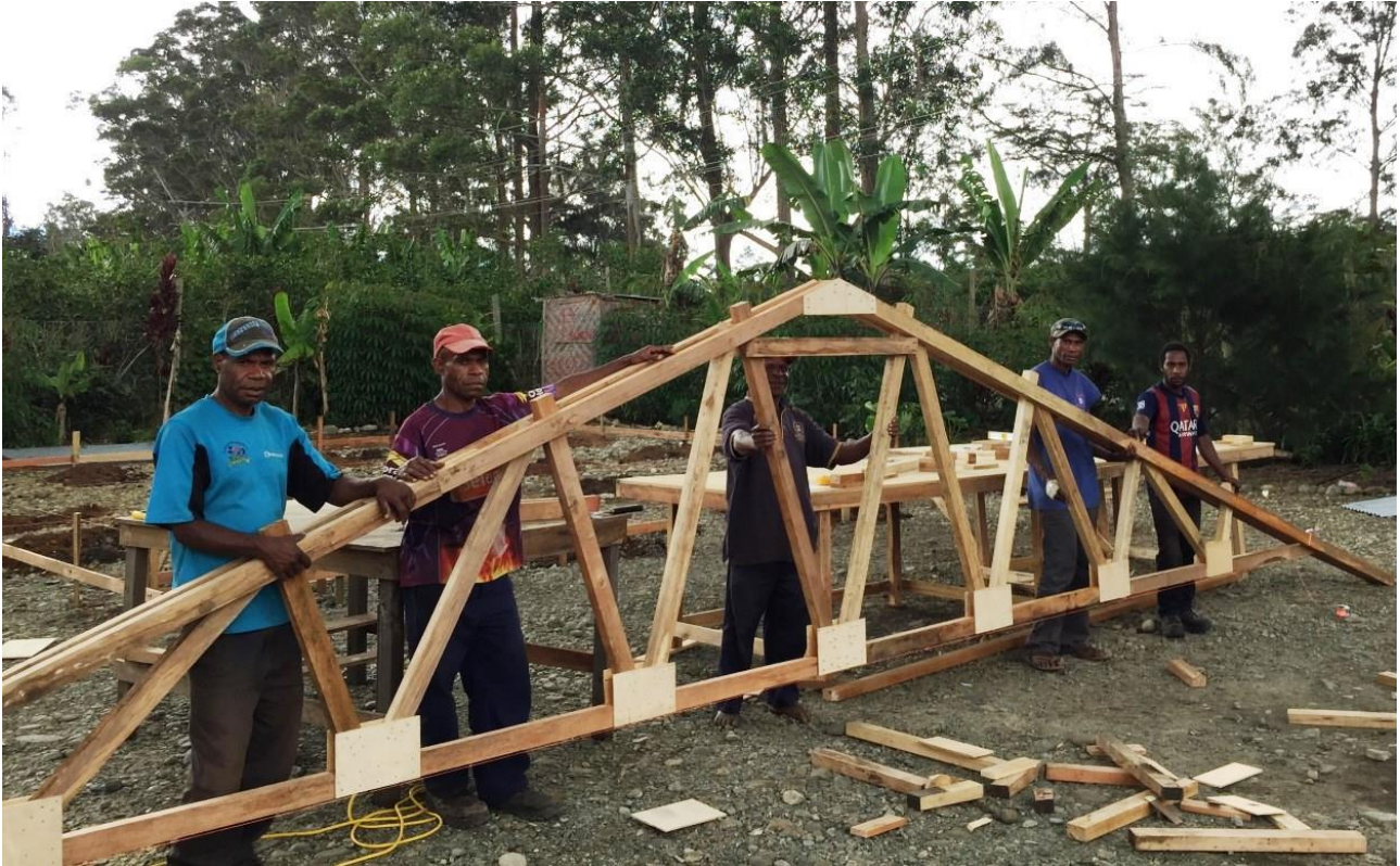
Prefabricated roof truss for clinic in Papua New Guinea Southern Highlands – Partner: Vision for Homes