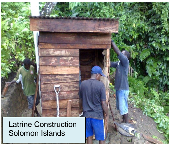
Latrine Construction Solomon Islands