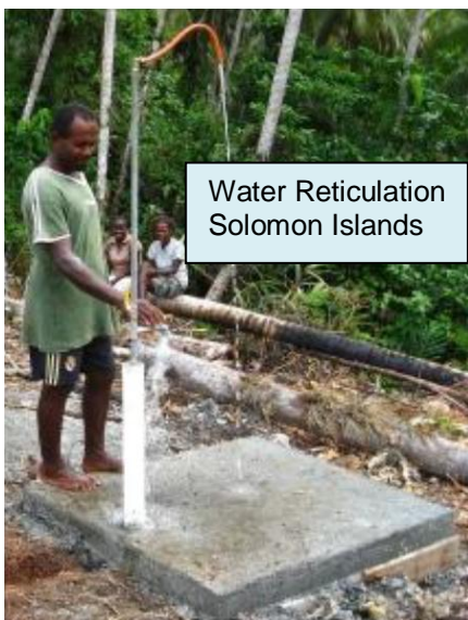
Water Reticulation Solomon Islands