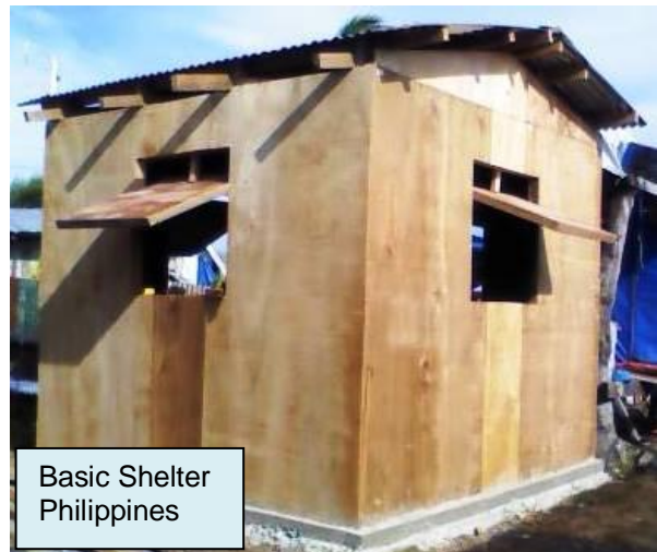
Basic Shelter Philippines