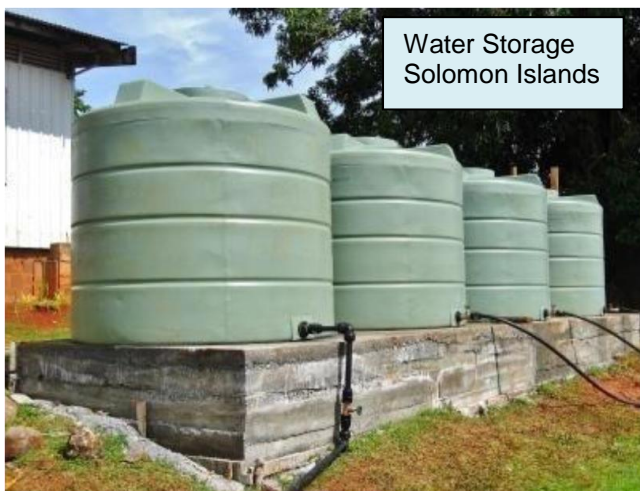
Water Storage Solomon Islands