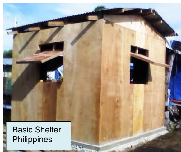
Basic Shelter Philippines