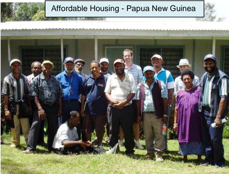
Affordable Housing - Papua New Guinea