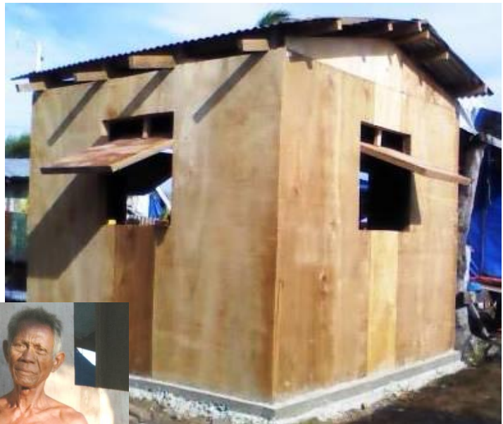
Rebuilding after Hurricane Haiyan

Proud owner of a 3.0 x 3.0 m Modular "Basic Shelter" with unique cyclone resistant features – The same structure serves as a transition house and as the shear core of an extended larger house.