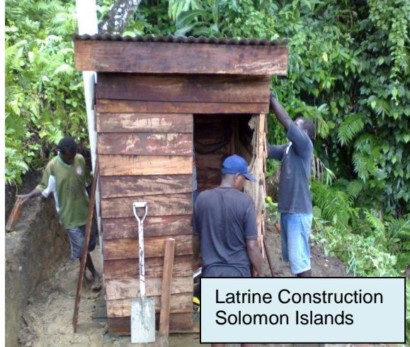
Latrine Construction Solomon Islands