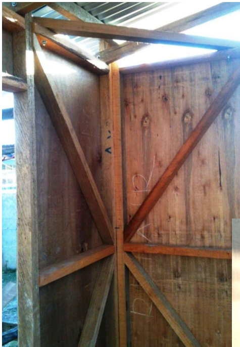
Braced Bolted and Built