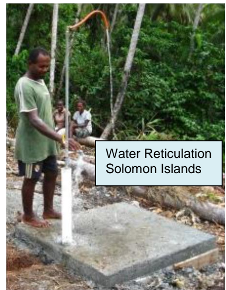
Water Reticulation Solomon Islands